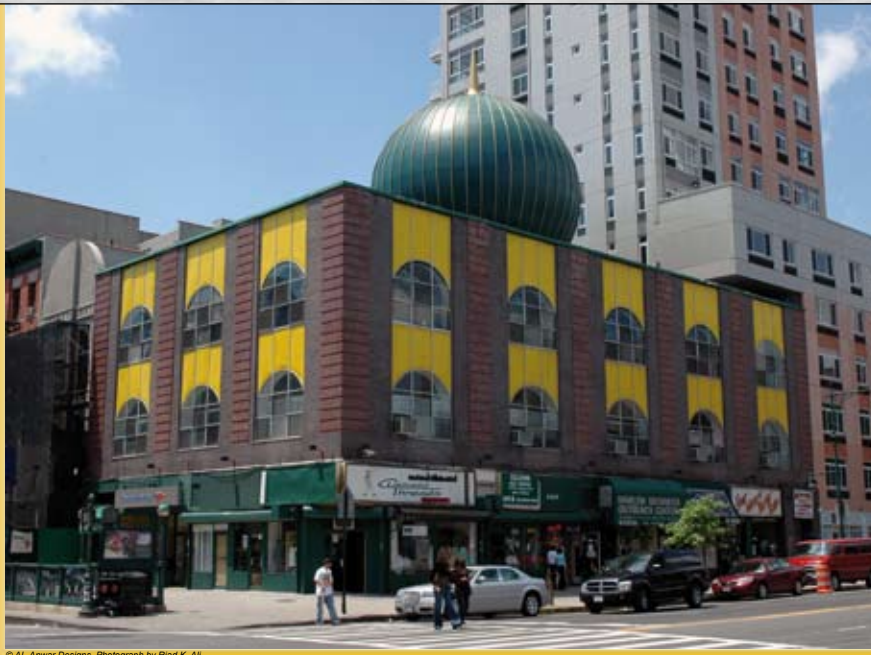
© AL-Anwar Designs. Photograph by Riad K. Ali